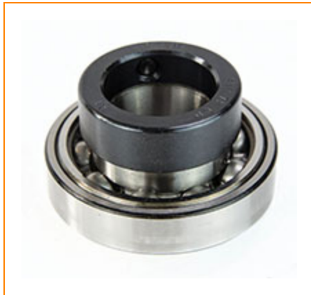
RA-RR, RA-RRB Standard Series